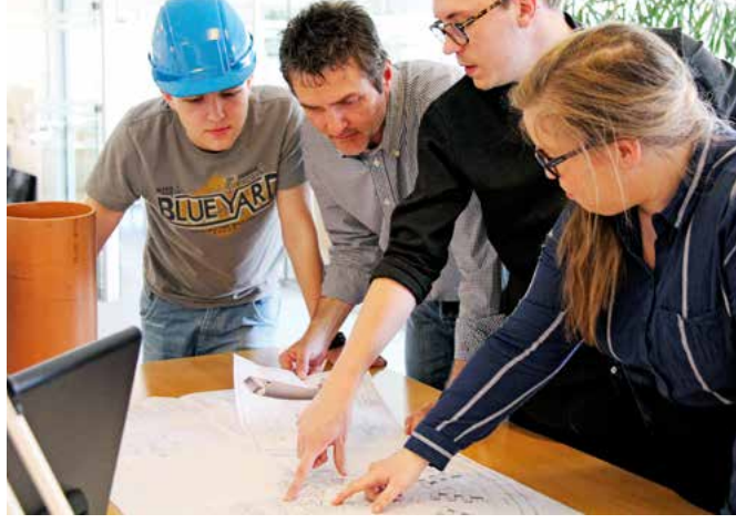
Uponor Infra provided a customised solution and offered a range of services and technical support.

"The chamber was made of Weholite panels. It gave us added value by saving us a lot of time. Since the chamber could be prefabricated and delivered in one piece, it was easy and fast for the constructor to install. Time was an important